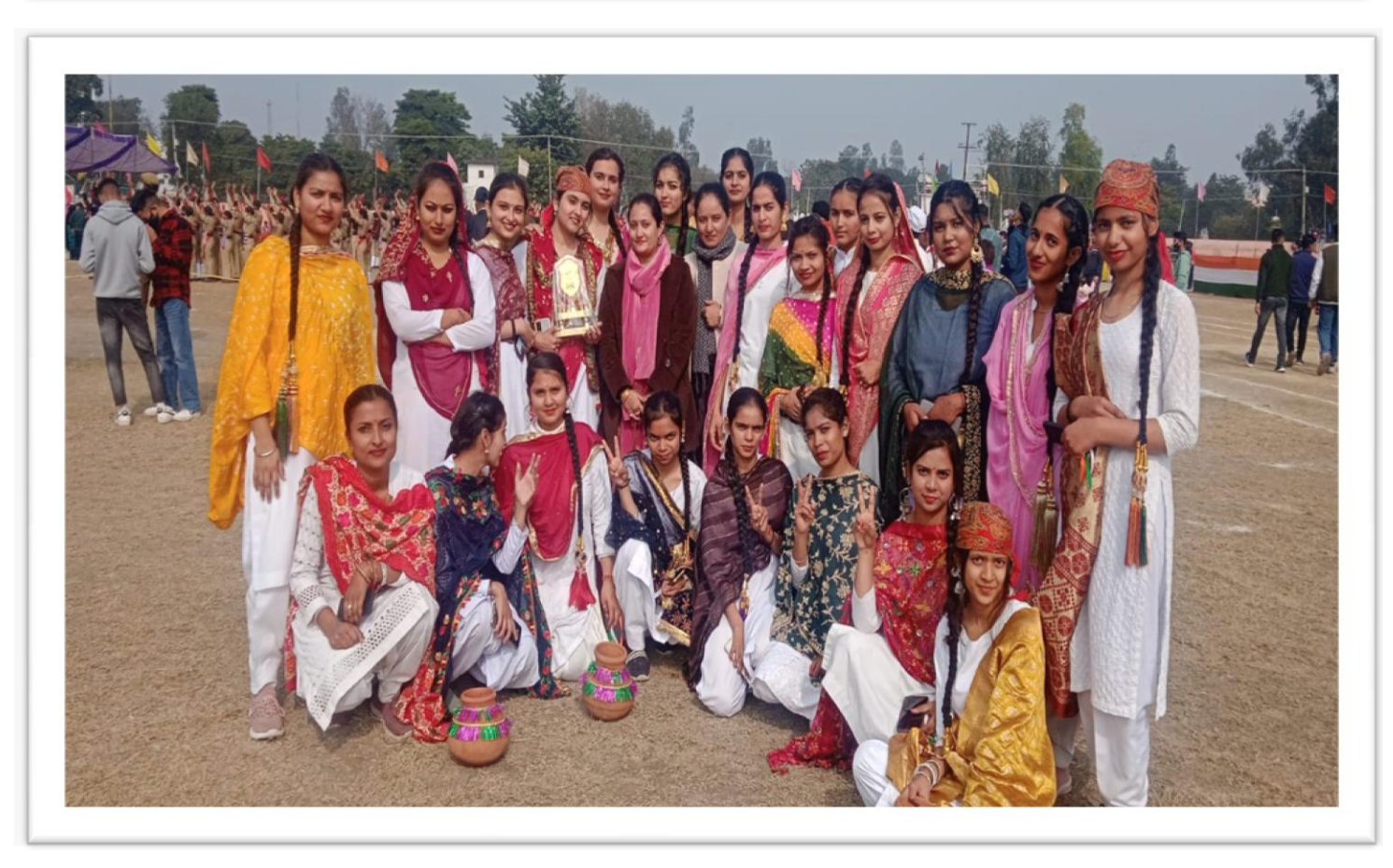
College students performing at various platforms in the Kathua district.