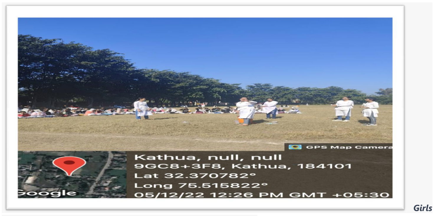
performing a Nukaad Natak on the Importance of Cleanliness .