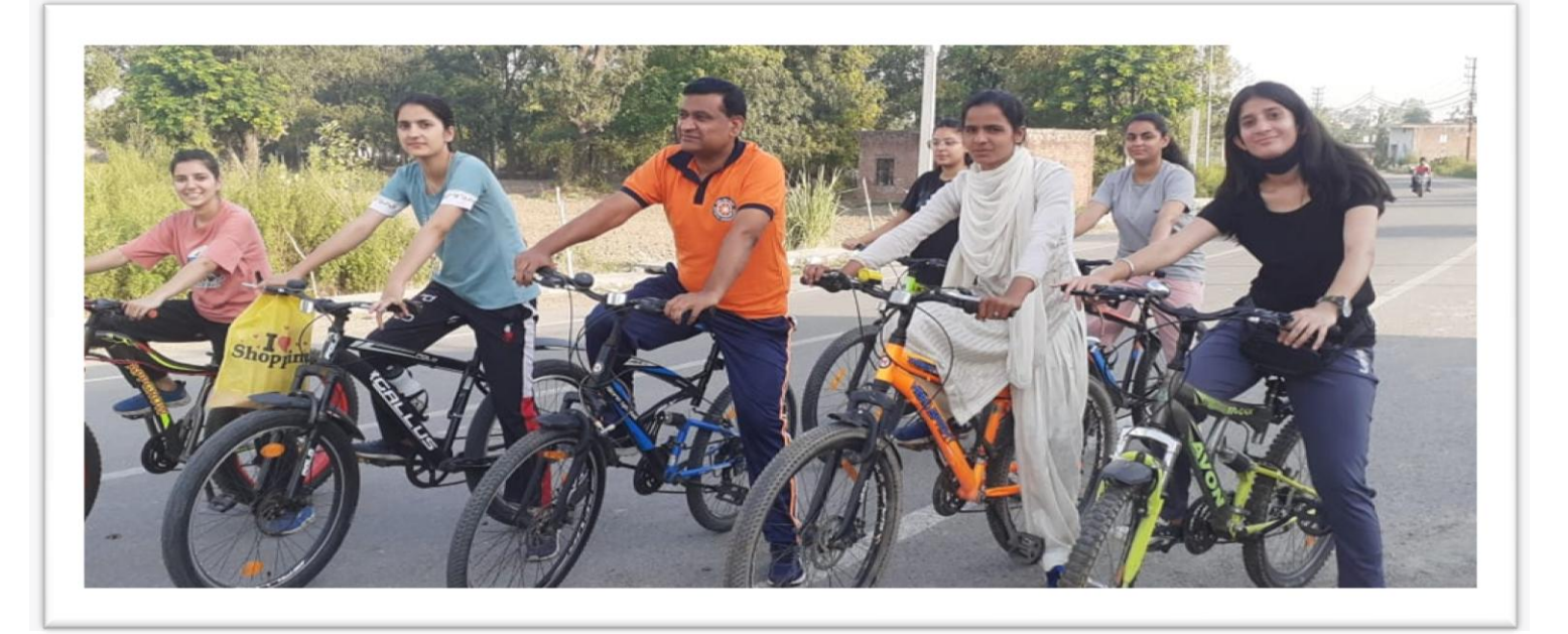
NSS Programme officer with NSS Volunteers during Bicycle Marathon.