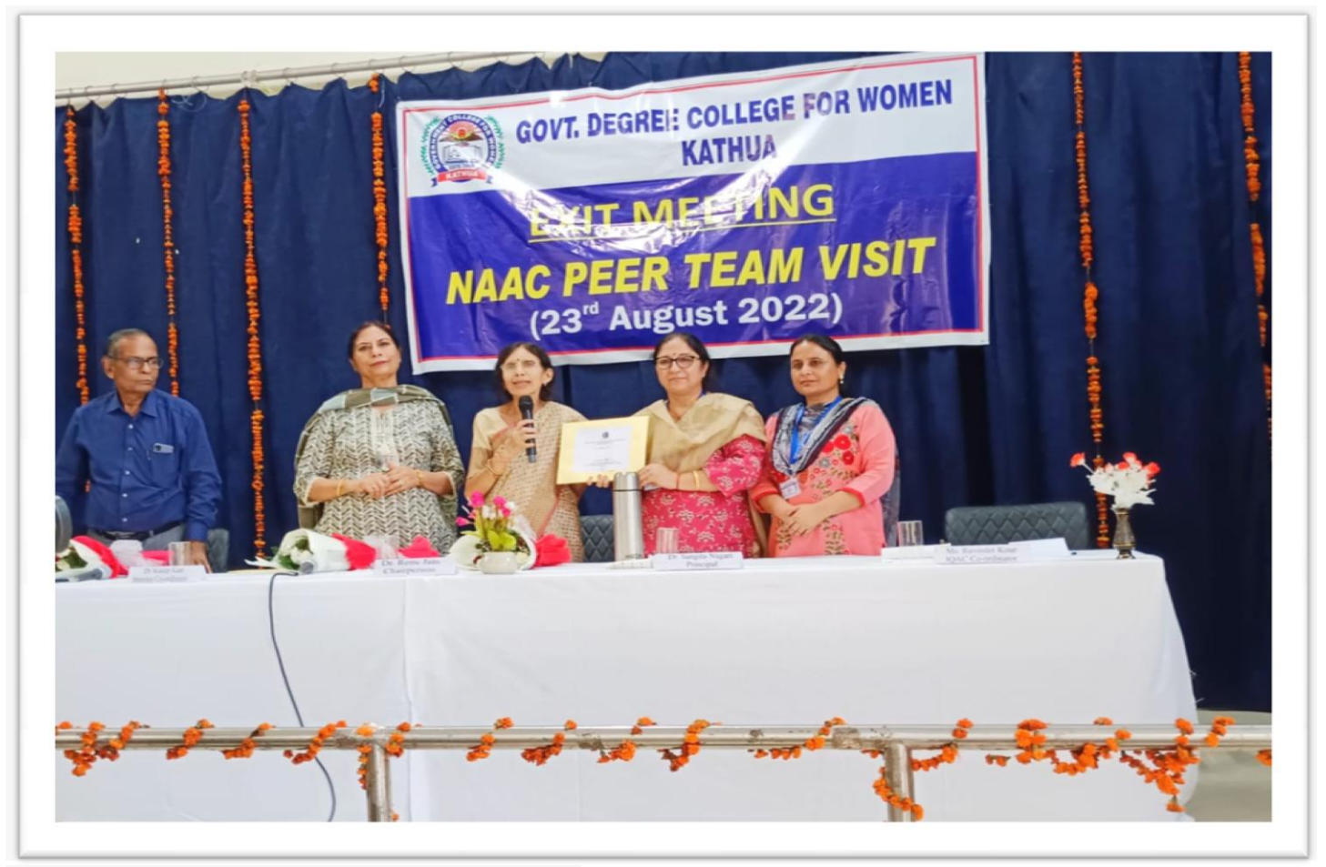
College being accredited by NAAC Peer Team.