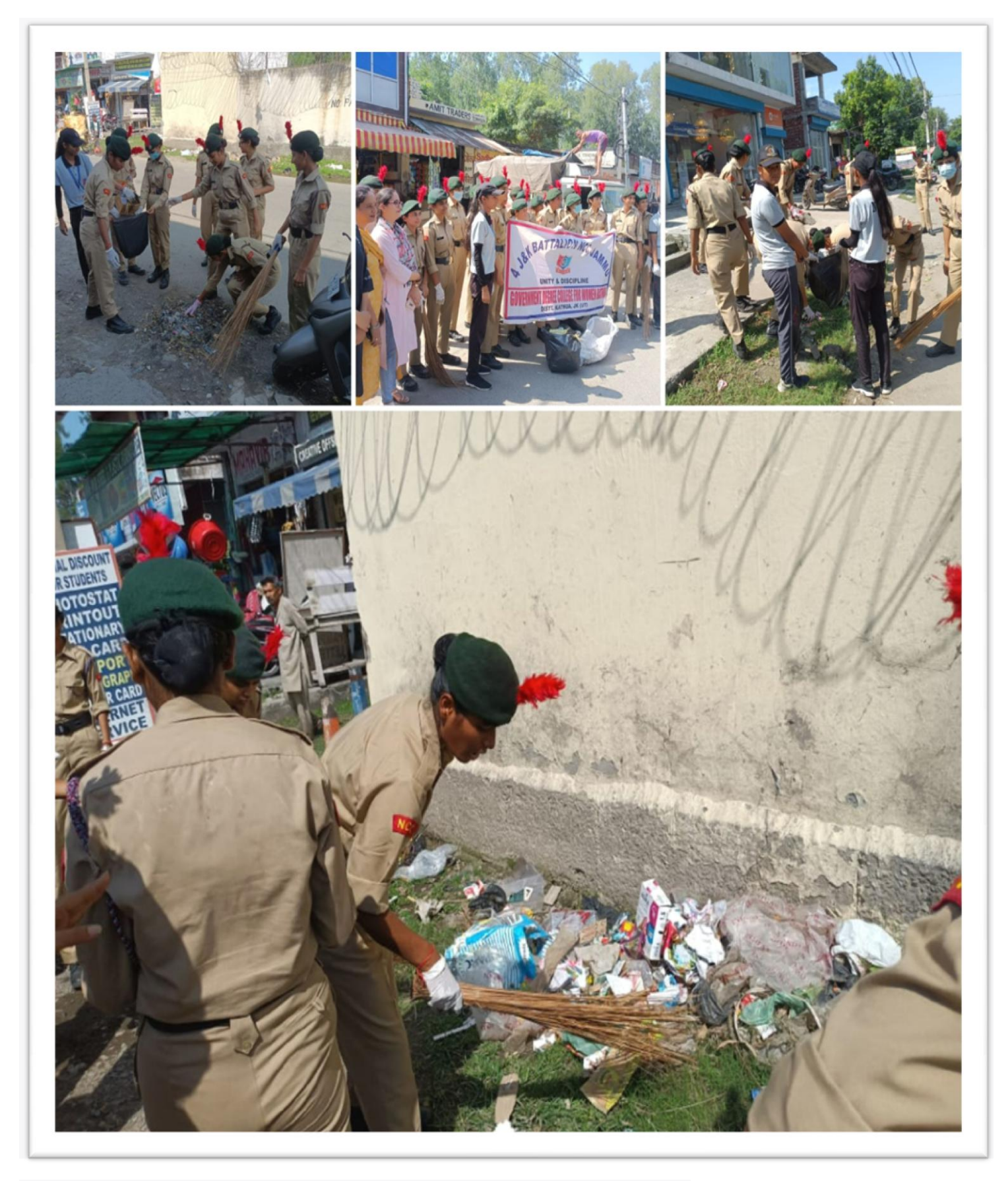
NCC Cadets during cleanliness drive at various locations in Kathua.