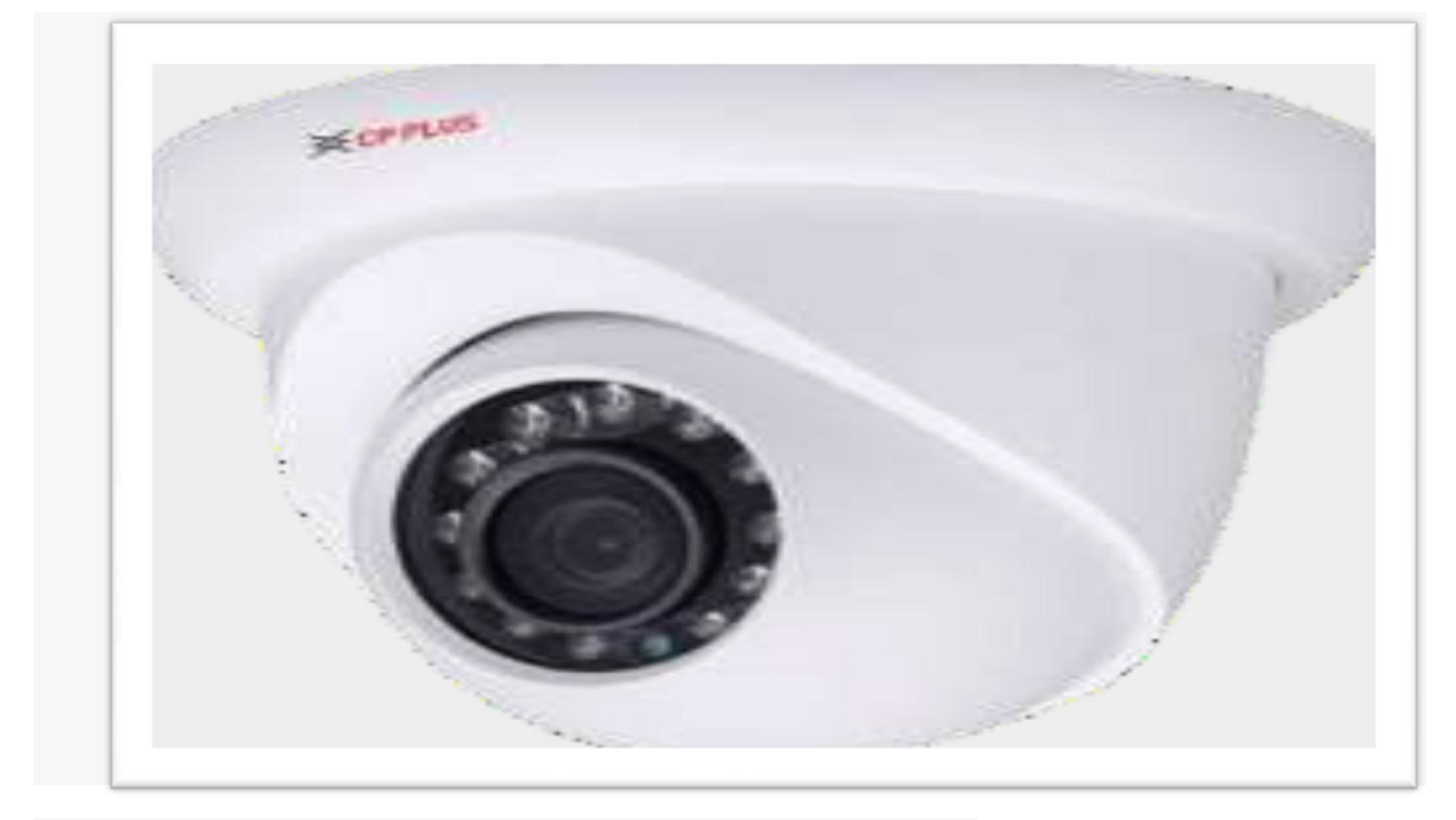
Security : 24 × 07 Security Guard, CCTV Surveillance