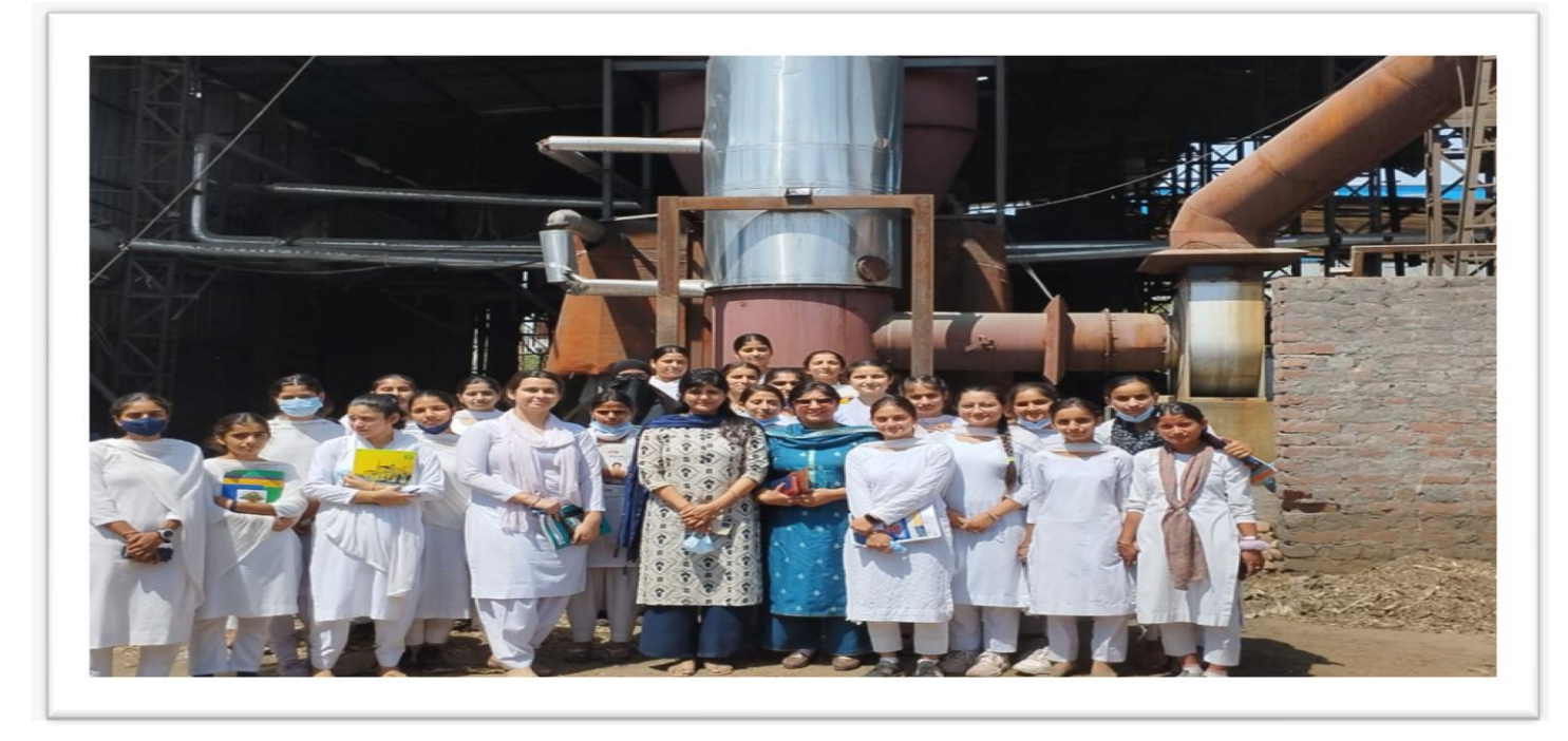
College students along with faculty during Industrial Visit.