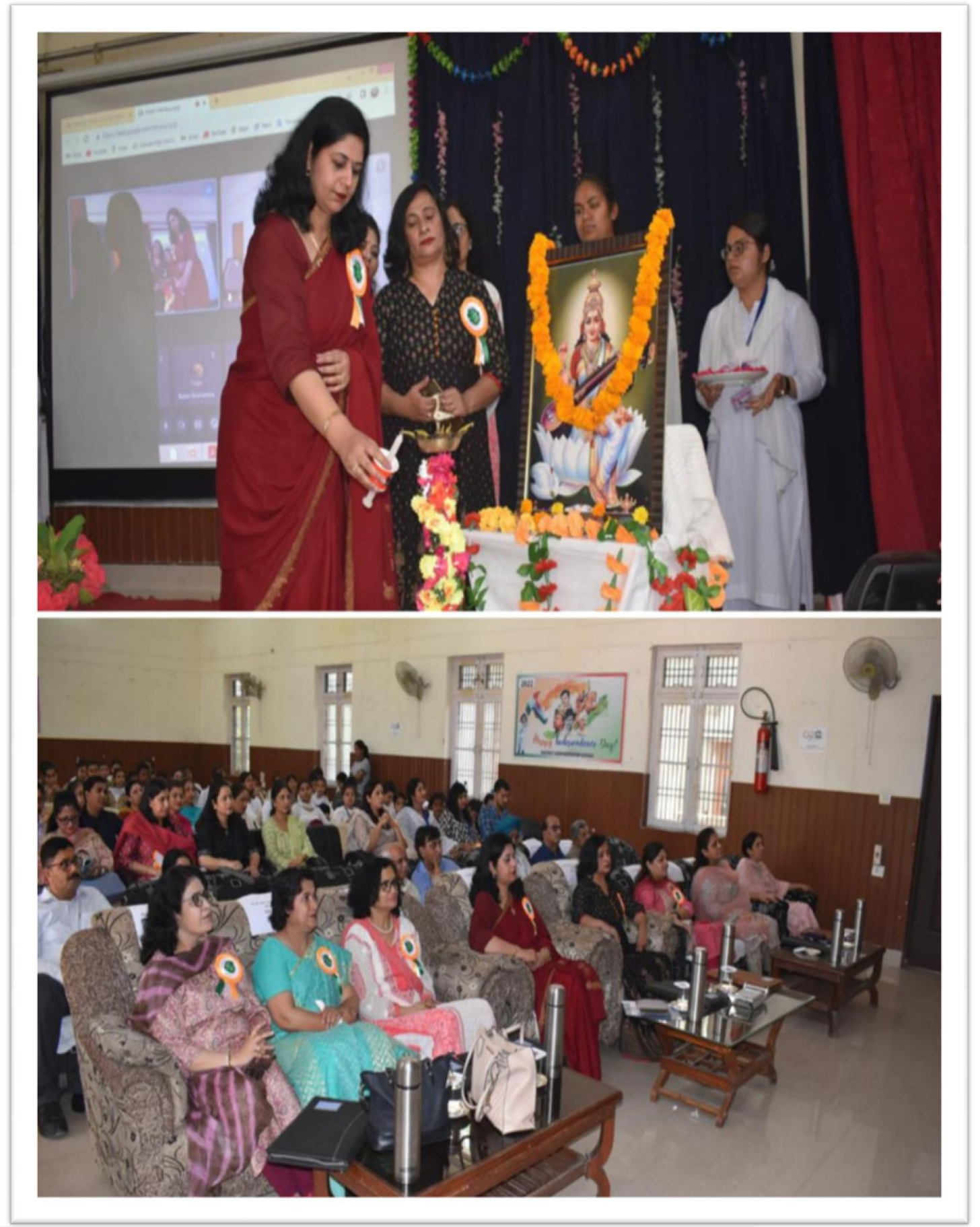
Glimpses of One Day National Seminar in Hybrid mode organized by the college.