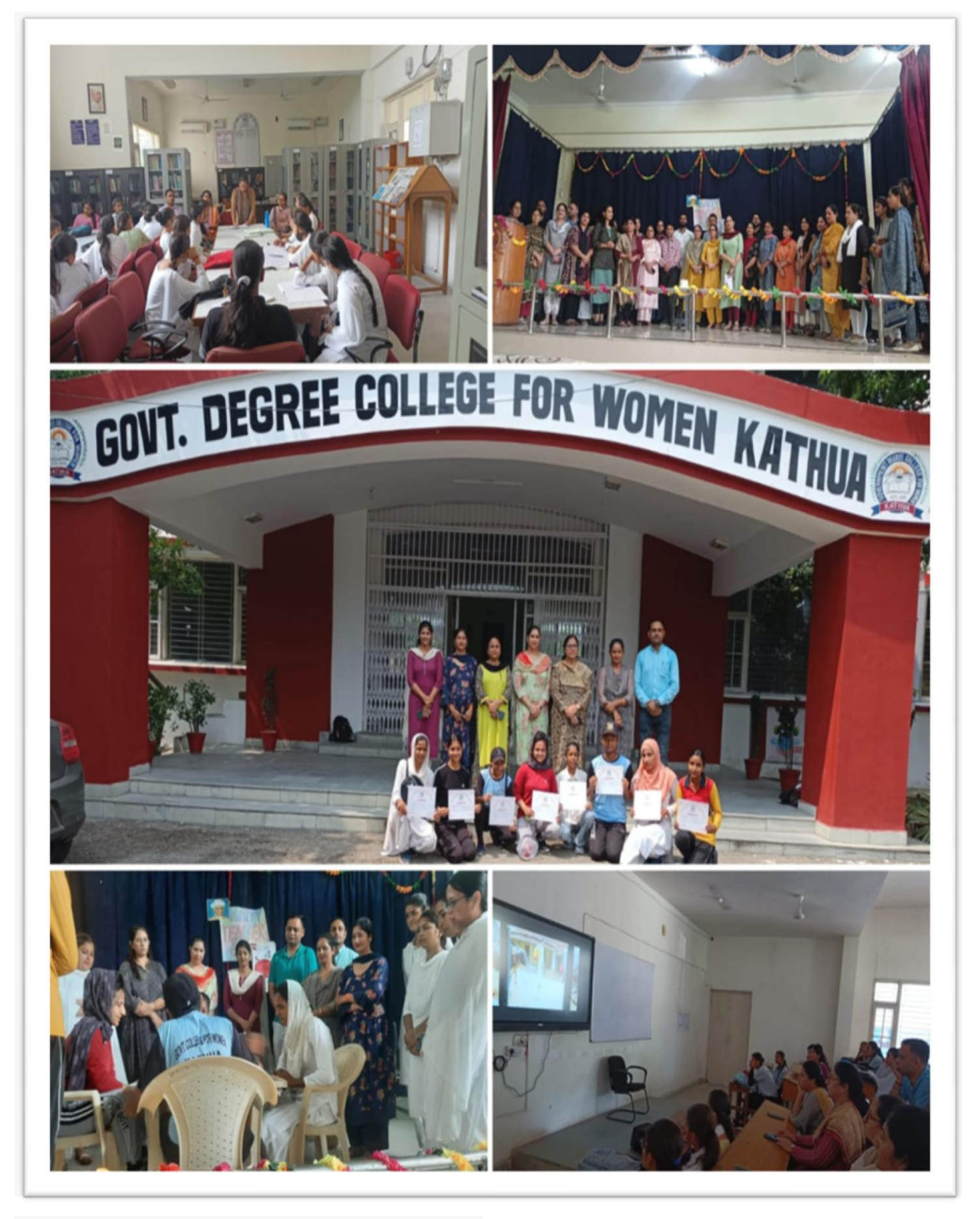
Glimpses of a week long Shikshak Parv Celebrations