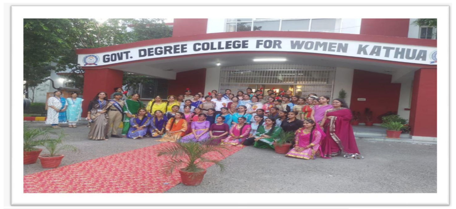
College students presented an enticing cultural evening during NAAC Team Visit.