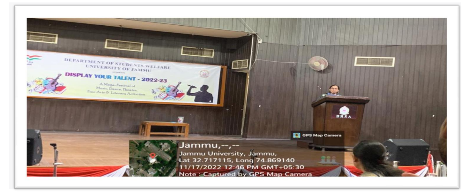
Students representing our college at University of Jammu.